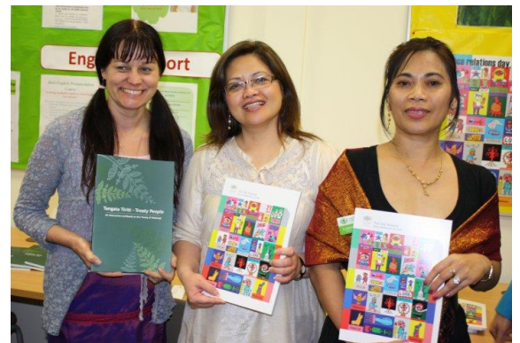
ARMS staff with Treaty Education Kit and Race Relations Report 2009

Hon. Pita Sharples said in his speech at Race Relations Dinner at Orakei Marae that tangata whenua (people of the land) and Maori have the duty to make newcomers, feel and be welcome, which is an essential part of tikanga Maori (Maori customary equivalent of law). You can read the full version of his speech on http://bit.ly/bwpECA .